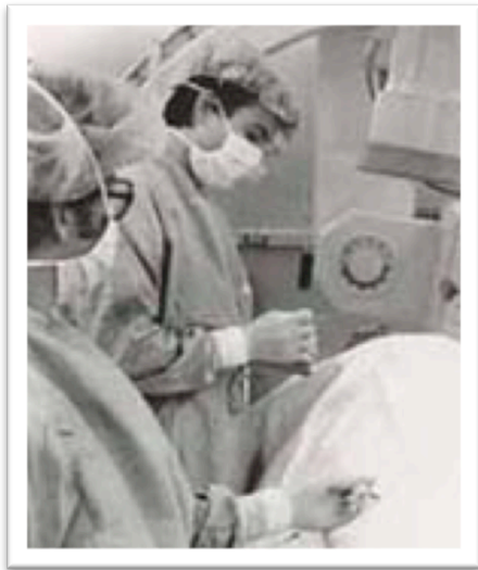
Dr. Andreas Gruentzig's first procedure