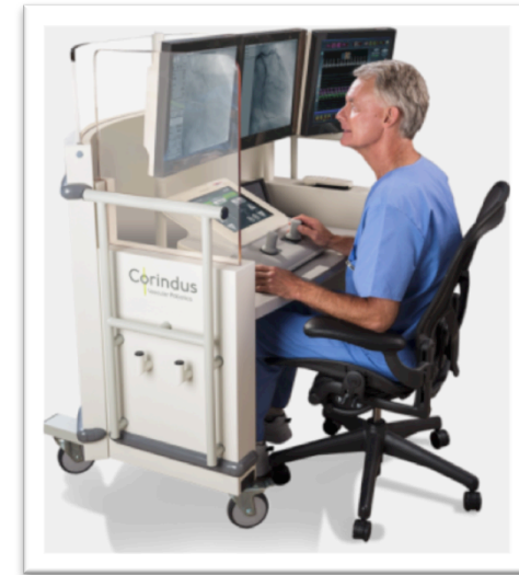
CorPath Robotic-assisted PCI